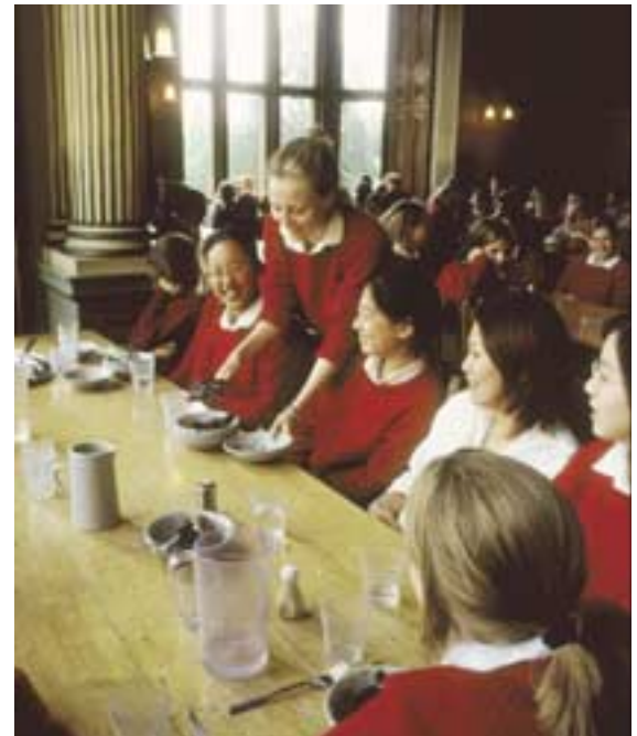
International students at Girls School Association (GSA) member schools in 1999