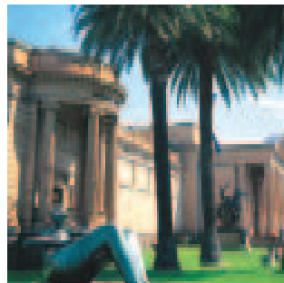
Art Gallery of New South Wales

Davis reports that many pubs serve cheap meals and visitors can even sometimes cook their own steak on the pub barbecue. 'This is a great way to practise