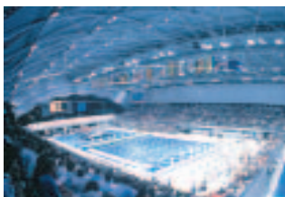
International Aquatic Centre, Homebush

'Part-time jobs are advertised in newspapers, backpacker magazines, at hostels and