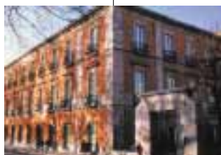
Museo Thyssen-Bornemisza Situated in the old Palacio de Villahermosa, close to the Prado, the Thyssen-Bornemisza art gallery has paintings spanning every major art movement from the 14 th to the 20 th century

All in all, Madrid offers language travel students a varied and exciting range of experiences, as Ledda sums up: "It is a city where [students] can enjoy the climate as well as art, literature, music and cuisine." □