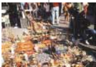
El Rastro This huge flea market, held on Sunday mornings in an old working-class area of Madrid, is popular with locals and visitors. Stalls sell anything from retro clothes and antiques to car parts

tions, and can include seafood, tortilla and cold meats. The Spanish even have a word – tapear – which means to move from one bar to another sampling different varieties of tapas. "Students like eating paella and tortilla ," says Cuevas. "They also enjoy trying other Spanish specialities such as Jamón Ibérico (cured ham)." Plaza Santa Ana, east of Puerta del Sol, boasts more than 200 tapas bars and is a popular student hangout.