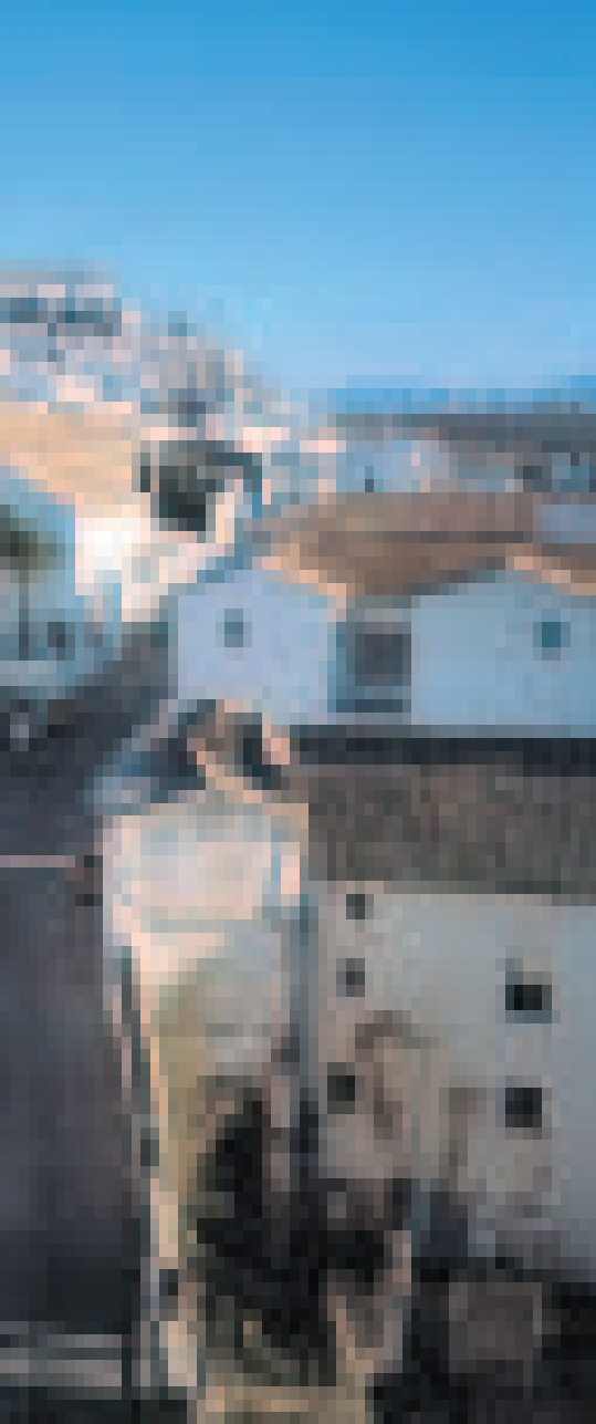
Andalusía is peppered with reminders of its past Moorish influences (main picture)

and miles of beaches, from the more rugged Atlantic beaches on the north coast and famous surf centres on its southern Atlantic coast, to the inviting beaches of the Mediterranean. It also has a string of islands, including the Balearic Islands to the south-east, and the Canary Islands to the southwest. 'Our school [Learn Spanish] is located in Las Palmas de Gran Canaria, 40 metres from the beach,' says Lagartos. The school's halls of residence are also close to the beach, which, according to Lagartos,