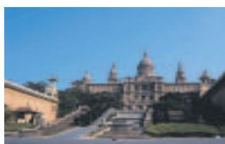
Castell de Montjuïc, Barcelona The Castell de Montjuïc is situated on a hill to the southwest of Barcelona and can be reached via a funicular railway. It provides stunning views of the city and now houses a military museum

Another city rich in history is Valladolid, the erstwhile political, cultural and financial centre of the Spanish empire. Today it is the capital of the Castilla y Leon region. 'For students of Spanish language and culture, this region offers an enviable [collection] of cultural riches amassing more than half the historical and artistic patrimony