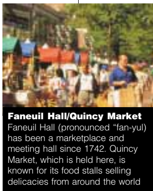
Faneuil Hall/Quincy Market

The Bunker Hill Monument stands on the site of the first major battle of the American Revolution, which took place in 1775. Today, it is part of the Freedom Trail, a walking experience of colonial Boston