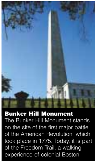
Bunker Hill Monument