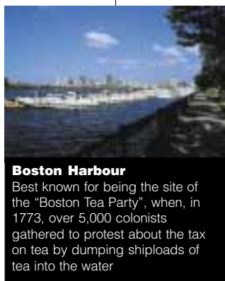
Boston Harbour Best known for being the site of the "Boston Tea Party", when, in 1773, over 5,000 colonists gathered to protest about the tax on tea by dumping shiploads of tea into the water