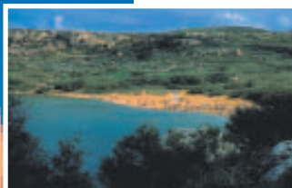
Ramla Bay, Gozo The golden sands of Ramla Bay are a popular spot for sun worshippers and water sports enthusiasts. The bay is situated beneath Calypso Cave and is reached via a steep pathway