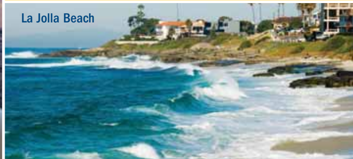
La Jolla Beach