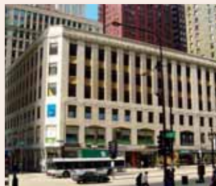
The new EF centre in Chicago

EF Chicago is the first EF language school to open in America's Midwest. It currently has 100 students enrolled after opening in April this year and will offer English programmes as well as short summer courses, general and intensive year-round courses and internships. ●