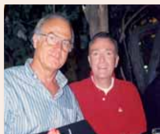
...and then in the early days

Pictures of workshops in the early years were displayed for delegates to look at, one of which is shown below. ●