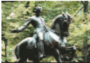
Paul Revere statue Situated on the Freedom Trail, this statue celebrates Paul Revere, who in 1775 rode to warn countryside inhabitants that British soldiers were coming. He is also immortalised in a poem