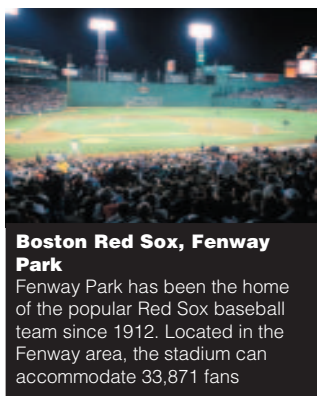
Boston Red Sox, Fenway Park

If it's history they're looking for, students have no need to travel very far. Boston has a rich history that is all around. One of the best ways to appreciate this is to walk the four-kilometre "Freedom Trail". Marked by a painted red line along the pavements, the trail takes visitors on a tour of the city's main historic sites, including the site of the Boston massacre, Bunker Hill and the USS Constitution, the US navy's oldest commissioned ship. The city also has plenty of museums to while away any rainy days, with