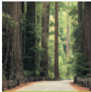
Redwood Forest Road, CA Redwood forests – the tallest living things on our planet – once covered this area before logging began in the 19th century. Today, redwood trees can still be seen in preserved parks and reserves