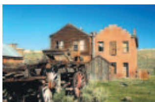
Sierra Nevada, CA The Sierra Nevada mountains span almost the whole state of California and evidence of past settlements depicting the harsh realities of the old frontier lifestyle still survive