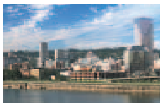
Portland, OR The city of Portland is a ‘green’ city and has an extensive public transport system. Its famous Metropolitan Area Express (MEA) light rail system provides access to all the city’s tourist areas

Insley, from Seattle Central Community College, emphasises the importance of the “warm connections” made between their international students and the local people. “Many international students volunteer in local schools and organisations through our service learning projects, enrol in community education courses, participate in religious organisations or are actively involved with American host families or their American conversation partners.” □