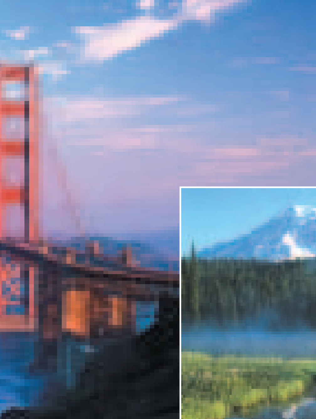
The Golden Gate Bridge (left) is one of San Francisco's top attractions, while Mount Rainier National Park in Washington (below) offers a view of the area's natural beauty