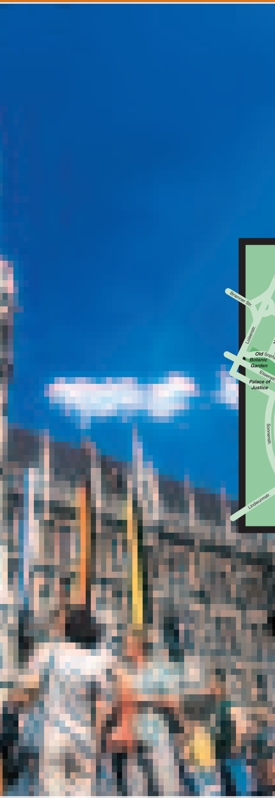
The Neues Rathaus is a central point in the city (main picture)