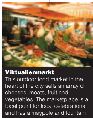
Viktualienmarkt This outdoor food market in the heart of the city sells an array of cheeses, meats, fruit and vegetables. The marketplace is a focal point for local celebrations and has a maypole and fountain

Being close to both mountains and lakes means Munich is an ideal location whatever the season. “In summer there are dozens of really beautiful lakes [in