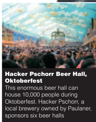
Hacker Pschorr Beer Hall, Oktoberfest

This enormous beer hall can house 10,000 people during Oktoberfest. Hacker Pschorr, a local brewery owned by Paulaner, sponsors six beer halls