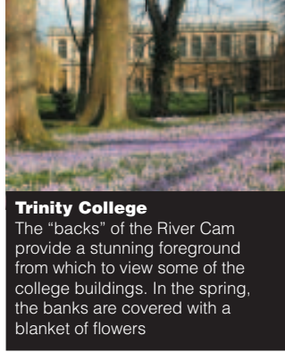
Trinity College The "backs" of the River Cam provide a stunning foreground from which to view some of the college buildings. In the spring, the banks are covered with a blanket of flowers

Cambridge's student-centred nature means that there are plenty of opportunities