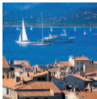
Saint Tropez Located on the Côte d’Azur on the Mediterranean coast, Saint Tropez is famous for the celebrity visitors it attracts. Rows of small cafés overlook the harbour where expensive yachts are plentiful

Paris itself has no end of sights for students to visit, while many enjoy visiting the city’s cafés, restaurants, bars and shops. There are also many festivals during the year, such as the festival of St Denis in June and the Festival of Autumn, which incorporates theatre, ballet, film, music and opera, in the latter part of the year. □