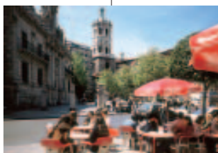
University of Valladolid The city's university was founded in the 13th century and is the third oldest university in Spain. There are numerous cafés and bars near the campus and the student population numbers over 40,000