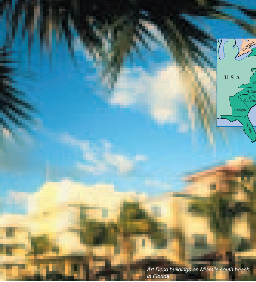
Art Deco buildings on Miami's south beach in Florida