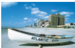
Atlantic City, NJ Once the fashionable summer retreat of affluent city dwellers, Atlantic City is now known as the Las Vegas of the east coast. A number of grand hotel casinos line the beach front