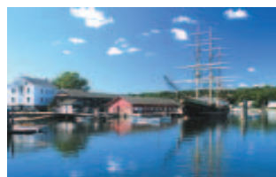
Mystic Seaport, CT Once a thriving port and ship building town, Mystic Seaport is now the largest maritime museum in North America. Visitors can sail or row exact replicas of traditional wooden boats

Dubbed the Athens of America, Boston itself has a European flavour, and is home to around 300,000 students during the academic year. "Few other cities in the United States provide students with such a exciting blend of culture, tradition and history," claims Hall.