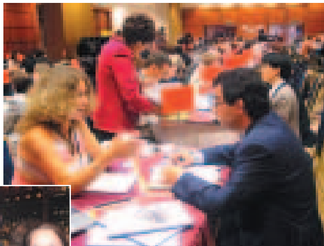
The Alphe Workshop (above) was one of the events providing business and social opportunities in the UK

"[The workshop was] really well organised and very pleasant,"