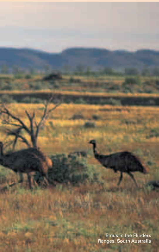
Emus in the Flinders Ranges, South Australia