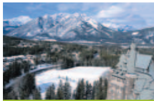
Banff, AB Located in the centre of Banff National Park, the town of Banff offers an ideal location from which to explore the Rocky Mountains. Popular attractions include the Banff Gondola and the hot springs

"Newcomers are often accepted very quickly and students receive invitations by locals to participate in activities, visit other regions and go out quite often," she says. "There is a particular love for Latin American/South American coun-