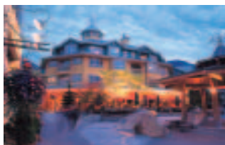
Whistler Village, BC Whistler is a popular place for skiers and snowboarders in winter and hikers in the summer. Whistler Mountain was originally named London Mountain by British naval officers in the 1860s