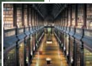
Trinity College, The Long Room, Old Library Trinity College, founded in 1592, is the oldest university in Ireland. In the Long Room, 200,000 of the library's oldest books are on display along with marble busts