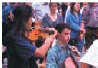
Musicians, Grafton Street Live music is a tradition in Ireland and in central Grafton Street, buskers often entertain the crowds of shoppers. Traditionally, live music in Ireland would include violin (fiddle) or flute playing