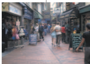
The Lanes The narrow alleys and cobbled streets of Brighton's Lanes make up one of the most historic parts of the city. Today, the area is full of fashionable shops, cafés, restaurants and street artists

Sprachcaffe has its own café-bar open to both students and the public. 'The bar hosts