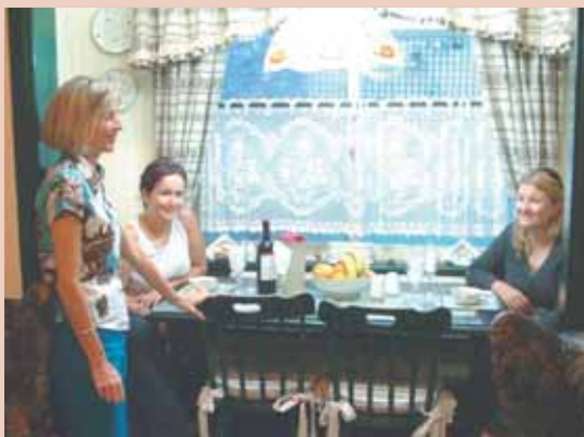
Host families like this one are in short supply this year

The problem seems to be the fact that taxation of host families has not previously been required and also that the new guidelines insist that social security contributions are paid from 2006 onwards if income exceeds ML3,100 (US$9,145). “In reality, families can have the [host family] licence in the husband’s name and avoid